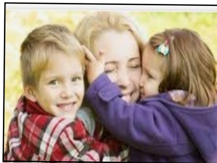
Part Taken from Parenting For Brain Health Brains. Happy Kids.